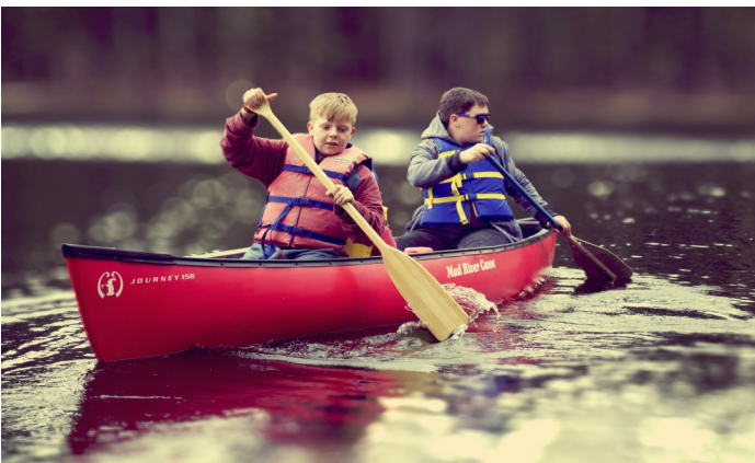
[Back to Table of Contents]